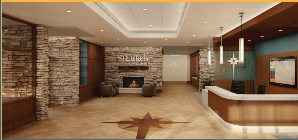
Rendering of main lobby

President St. Luke's Quakertown and Upper Bucks Campuses