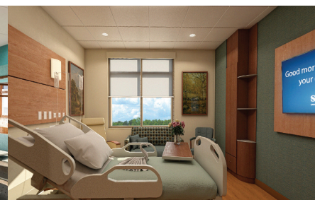
Rendering of patient room