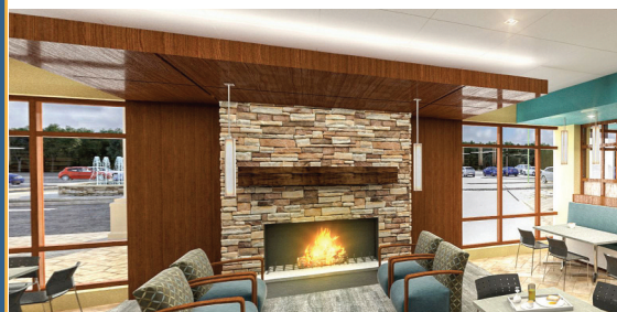
Rendering of cafeteria

The new location will include ample parking and will be easily accessible to patients and their families. It is also close in proximity to many major manufacturers and local businesses and will be equipped to provide enhanced care and services to address the needs of major employers in the region.