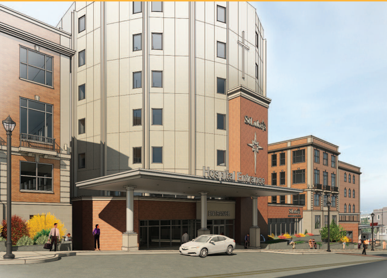
St. Luke's Sacred Heart Campus